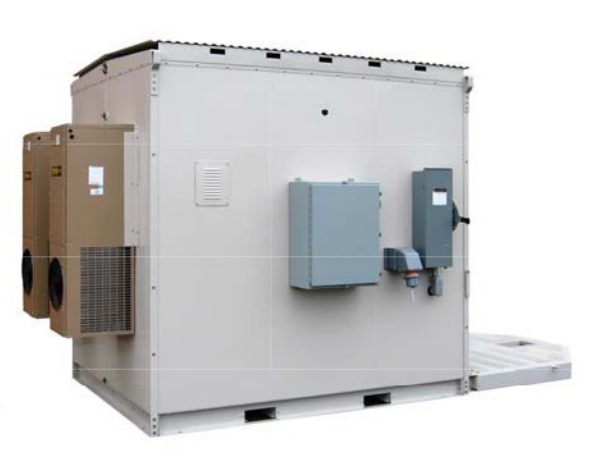
Optional wall mounted air conditioners, emergency generator connection system, and special hinged satellite dish mounting platform shown.